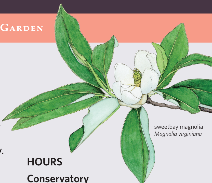
sweetbay magnolia Magnolia virginiana

The Garden maintains approximately 65,000 plants for exhibition, study, conservation, and exchange with other institutions. Noteworthy collections include economic plants, medicinal plants, orchids, carnivorous plants, cacti and succulents, and Mid-Atlantic native plants. Several plants collected during the U.S. Exploring Expedition are still on display.