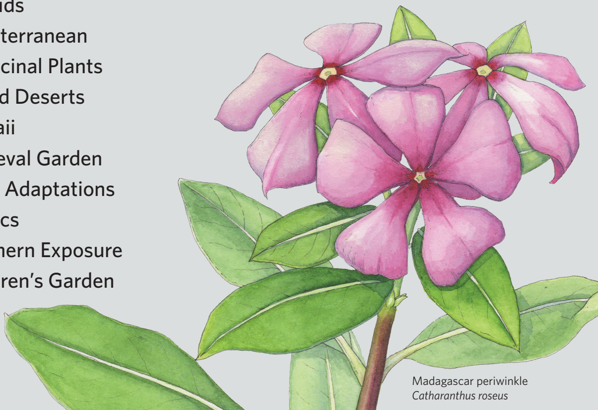
Madagascar periwinkle Catharanthus roseus