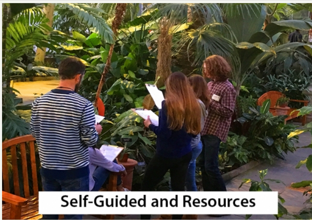
Self-Guided and Resources