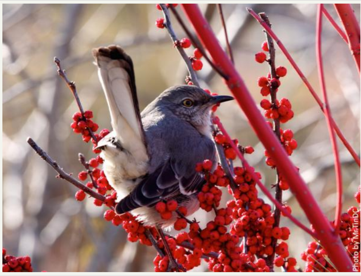
Northern mockingbird (Mimus polyglottos) eating winterberry (Ilex verticillata) in the National Garden